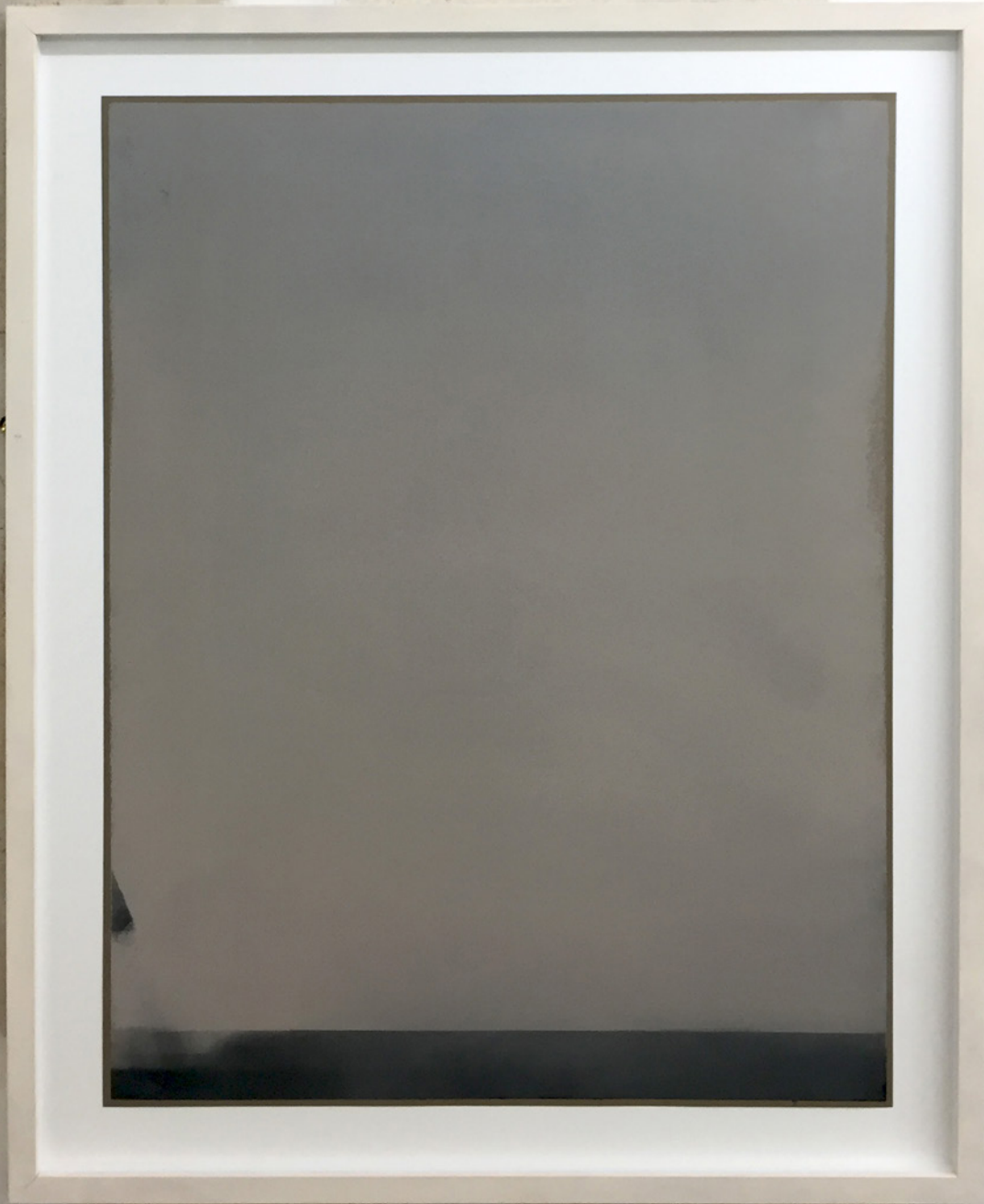
Untitled 2009 pastel on paper 65 x 50 cm (framed 75.5 x 61 cm)