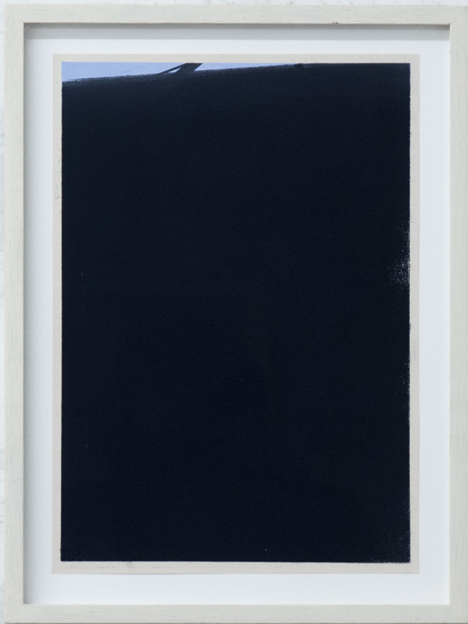
Untitled - A4 series 2017 pastel on paper 29.7 x 21 cm (framed 35.3 x 26.5 cm)