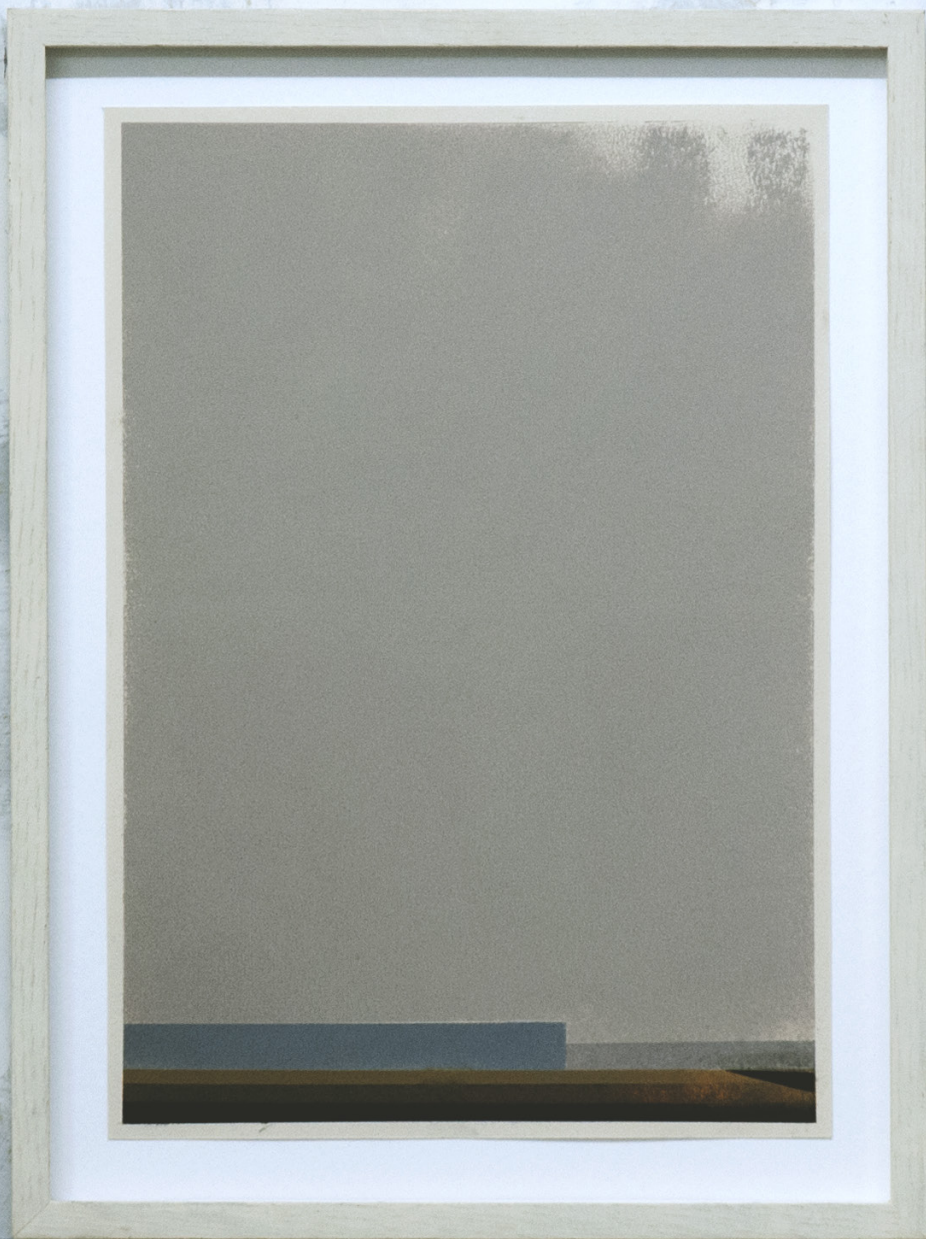
Untitled - A4 series 2017 pastel on paper 29.7 x 21 cm (framed 35.3 x 26.5 cm)