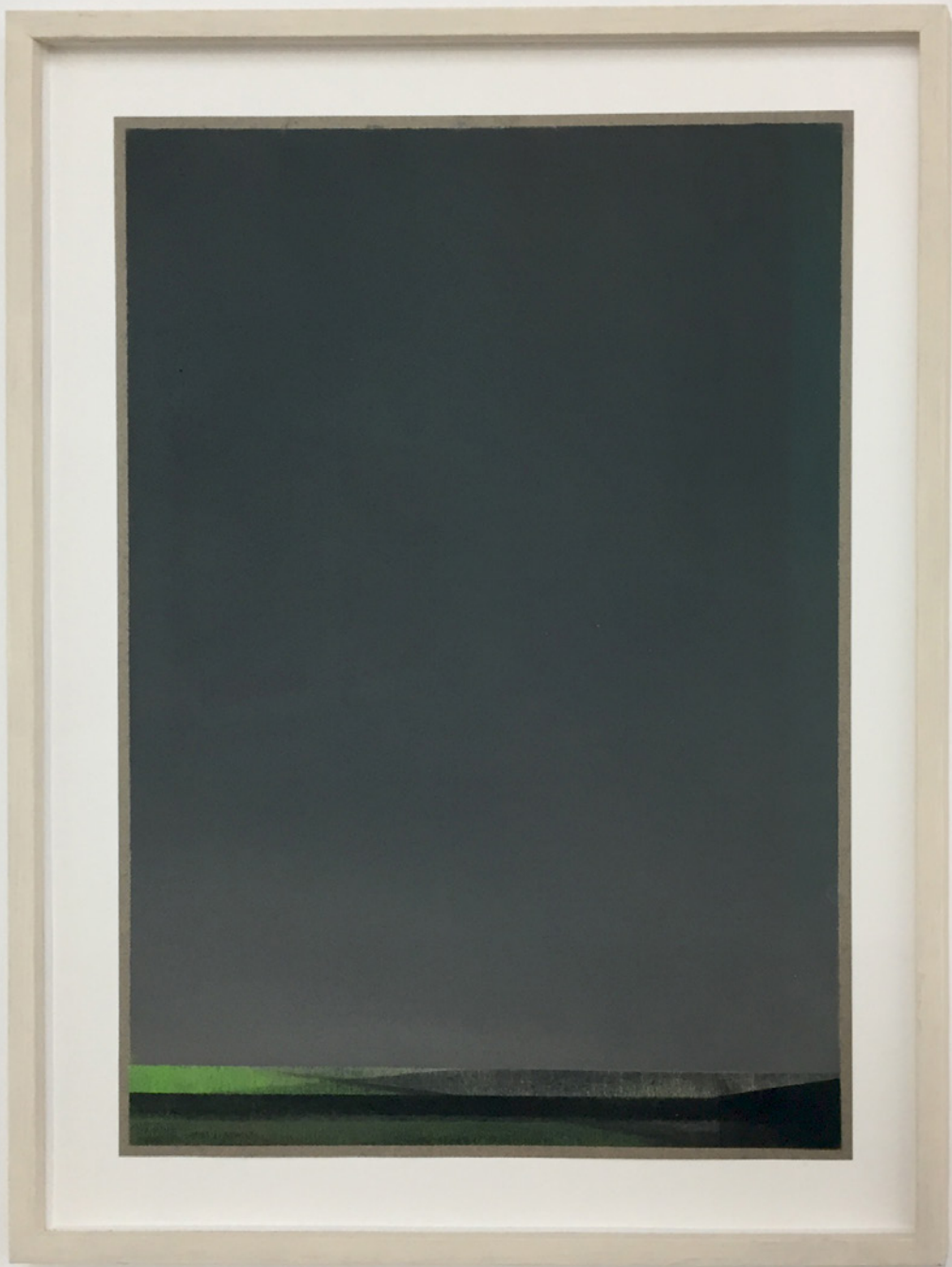
Untitled 2017 pastel on paper 42 x 29.7 cm (framed 49.5 x 37 cm)