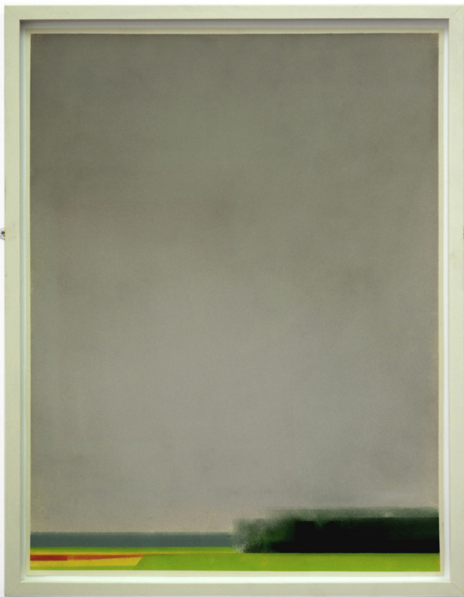
Untitled 2017 pastel on paper 65 x 50 cm (framed 69.5 x 54.8 cm)