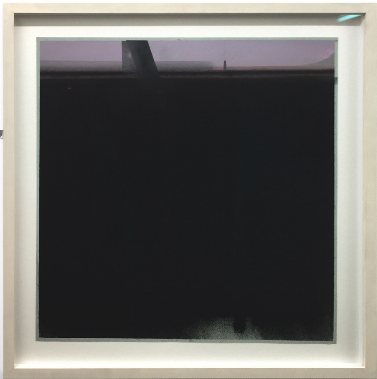
Untitled - Square series 2015 pastel on paper 50 x 50 cm (framed 61 x 61 cm)