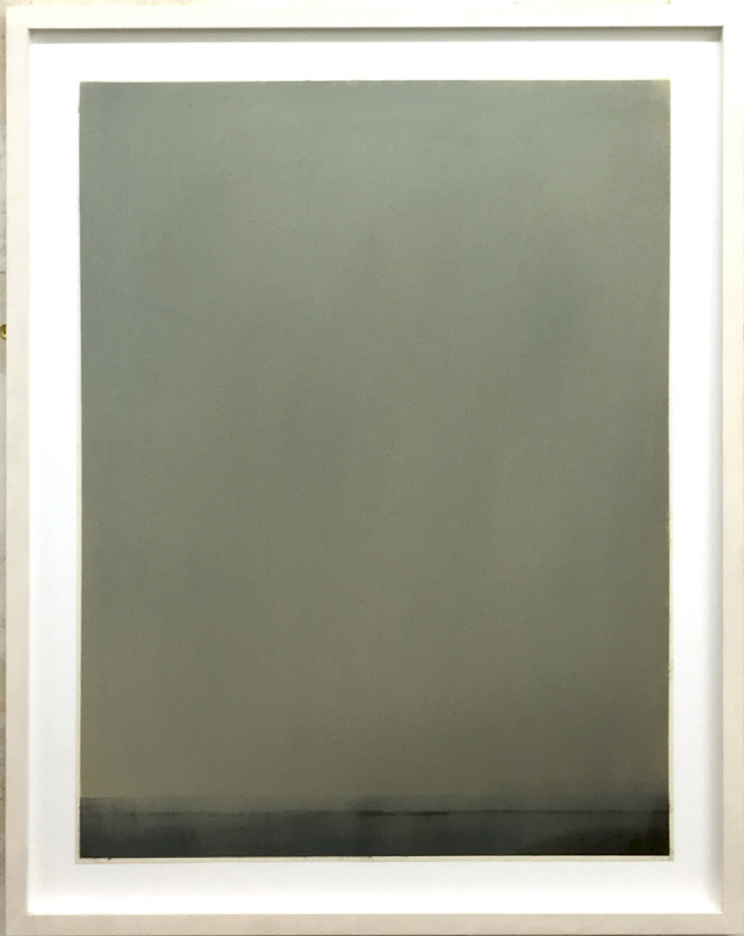
Untitled 2009 pastel on paper 65 x 50 cm (framed 75.5 x 61 cm)