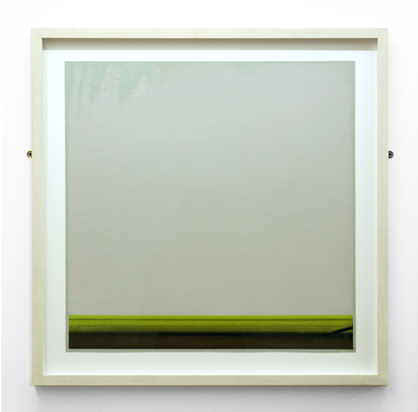
Untitled - Square series 2015 pastel on paper 50 x 50 cm (framed 61 x 61 cm)