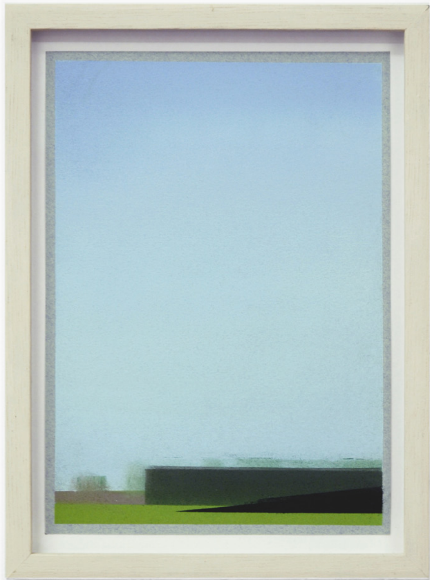
Untitled 2017 pastel on paper 21 x 14.8 cm (framed 24.5 x 18.5 cm)