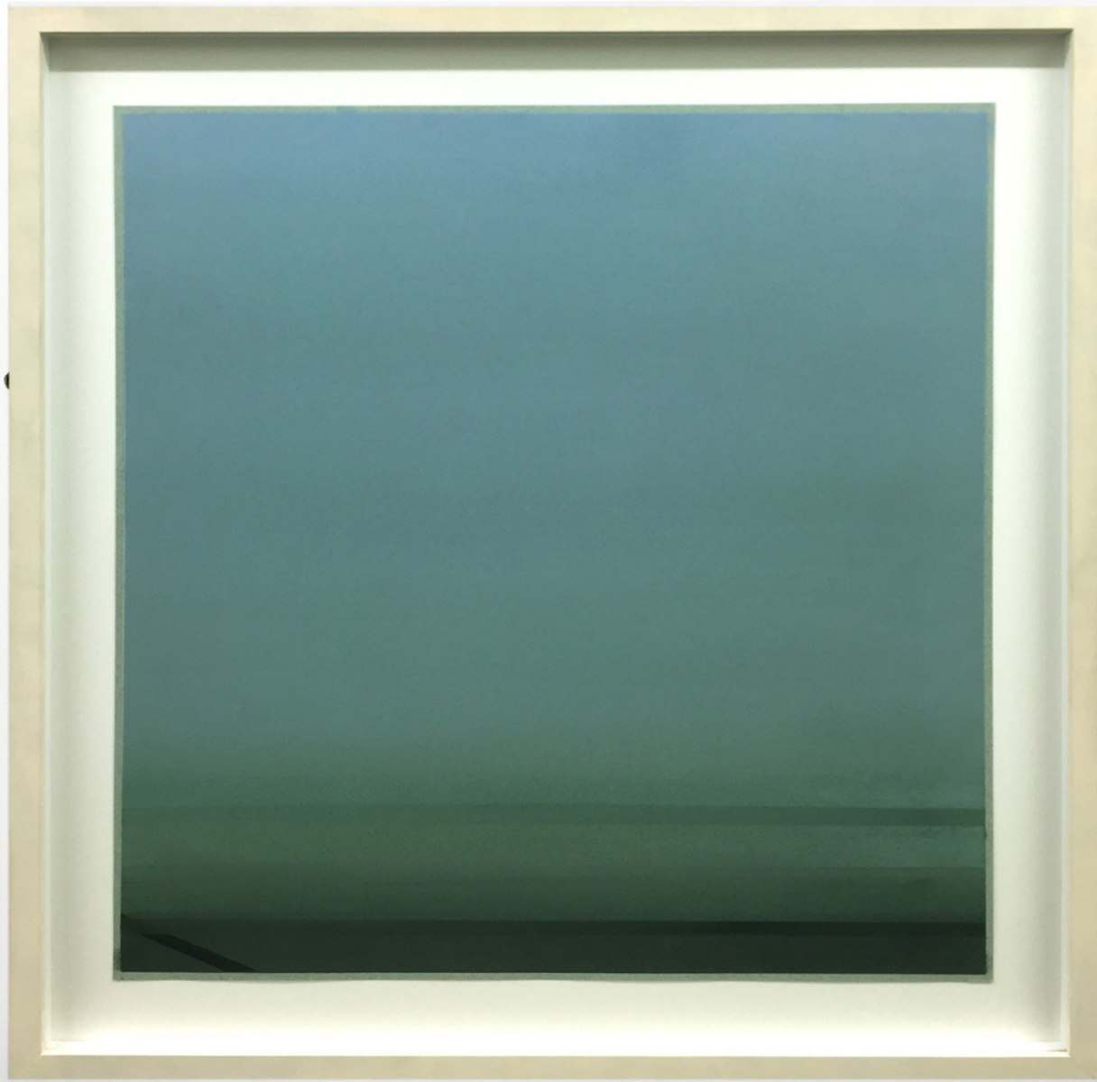
Untitled - Square series 2015 pastel on paper 50 x 50 cm (framed 61 x 61 cm)