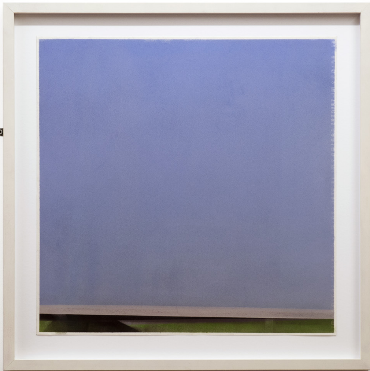
Untitled - Square series 2015 pastel on paper 50 x 50 cm (framed 61 x 61 cm)