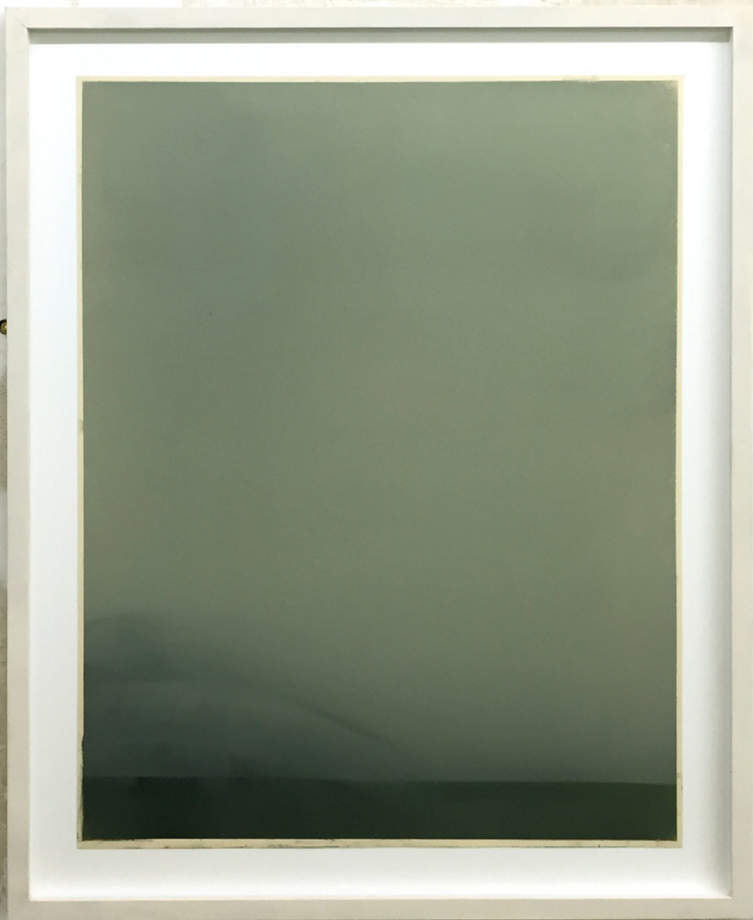
Untitled 2009 pastel on paper 65 x 50 cm (framed 75.5 x 61 cm)