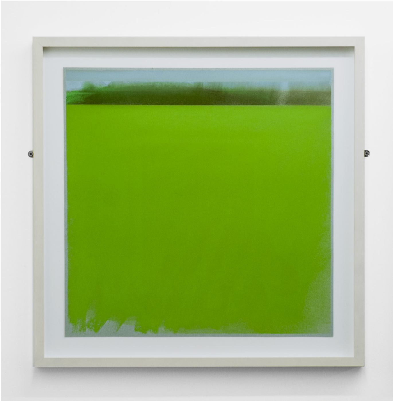
Untitled - Square series 2015 pastel on paper 50 x 50 cm