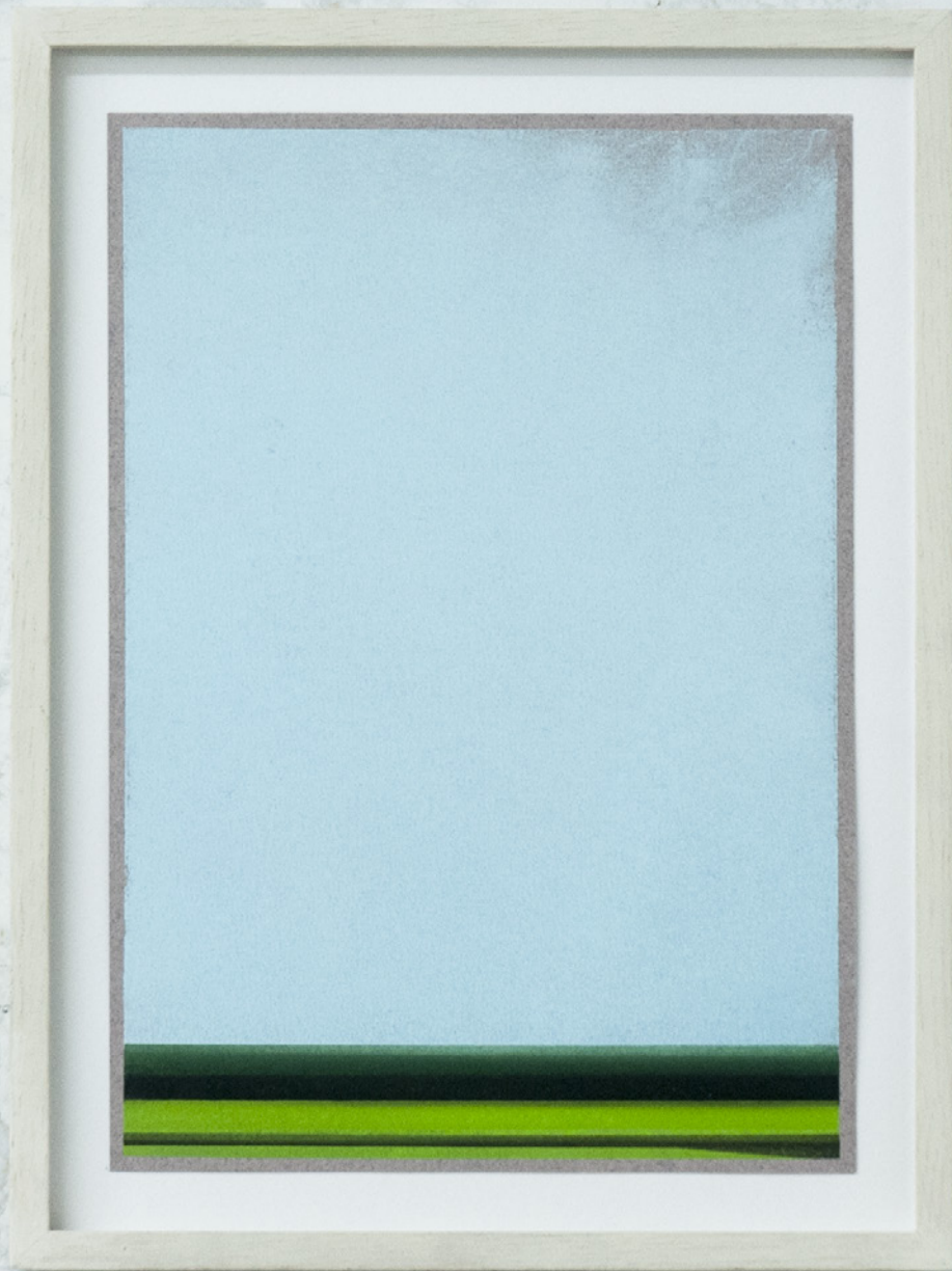
Untitled - A4 series 2017 pastel on paper 29.7 x 21 cm (framed 35.3 x 26.5 cm)