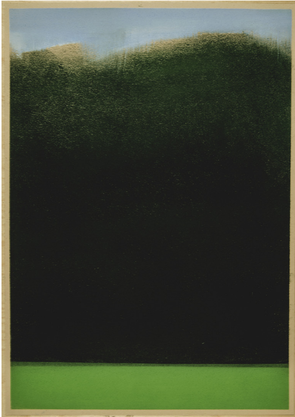
Untitled 2017 pastel on paper 42 x 29.7 cm