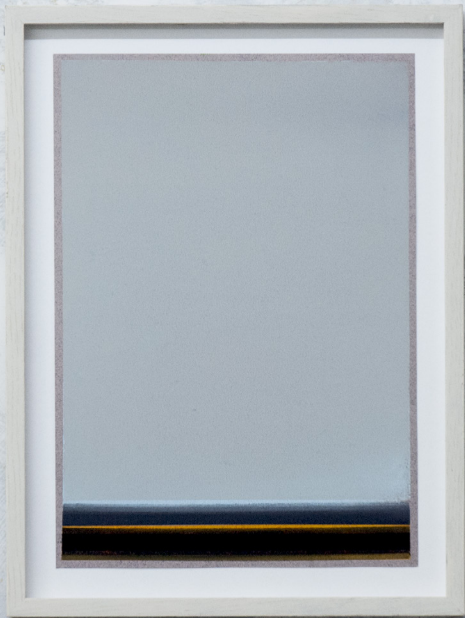
Untitled - A4 series 2017 pastel on paper 29.7 x 21 cm