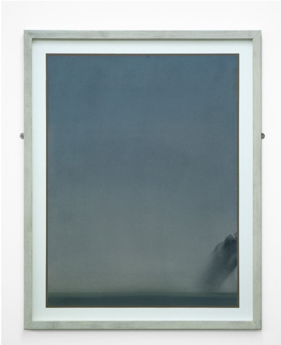
Untitled 2009 pastel on paper 65 x 50 cm (framed 75.5 x 61 cm)