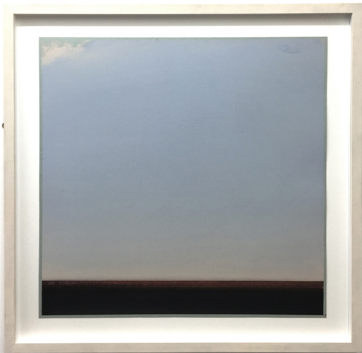
Untitled - Square series 2015 pastel on paper 50 x 50 cm (framed 61 x 61 cm)