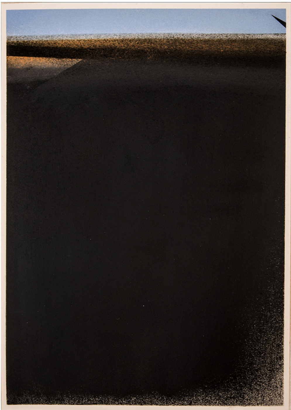
Untitled 2017 pastel on paper 42 x 29.7 cm (framed 49.5 x 37 cm)