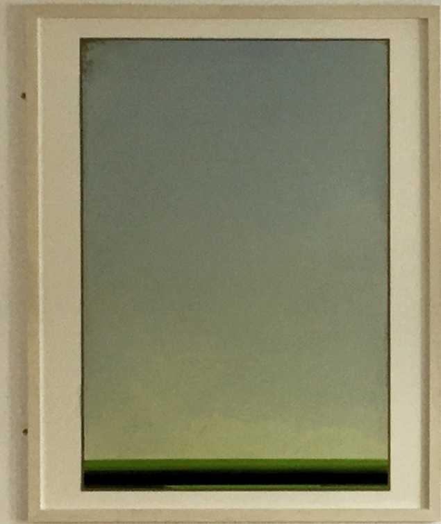
Untitled 2017 pastel on paper 110 x 75 cm